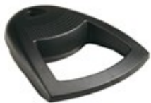
Table base The table base is an accessory that must be ordered separately.